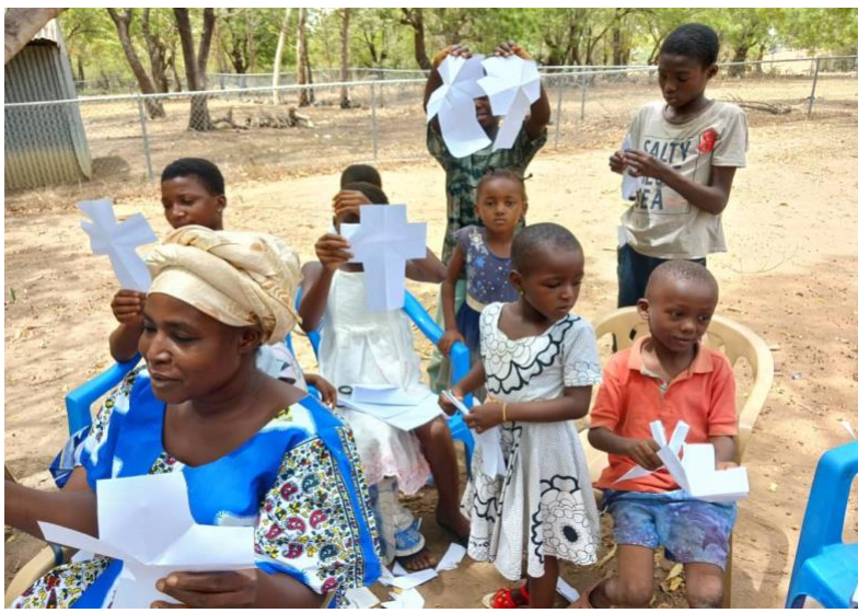
Adults and children having fun making paper crosses.

Pray that God would identify more people in local churches with a love for God and children, and time to give themselves to children's ministry. Pray for churches to honour and support their ministry.