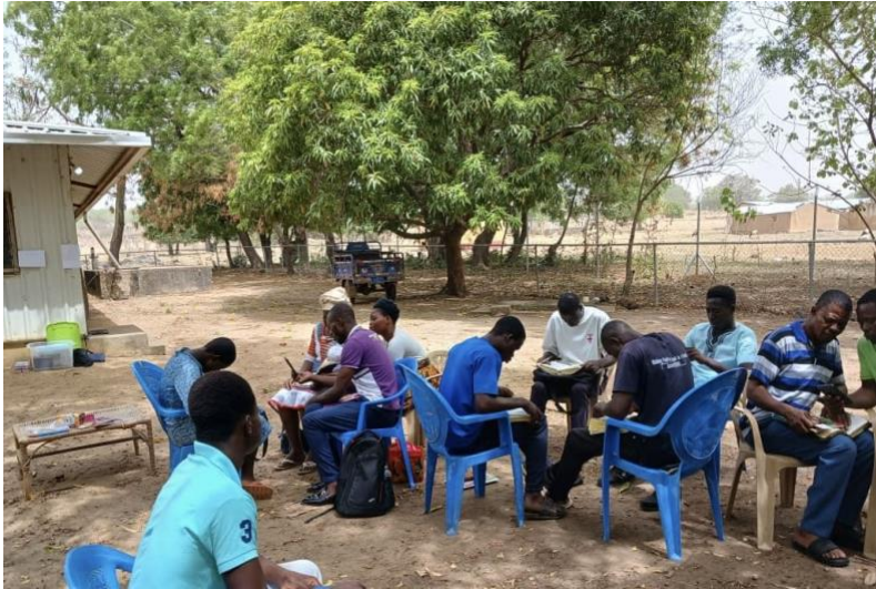
1 for 50 training in Chiana,